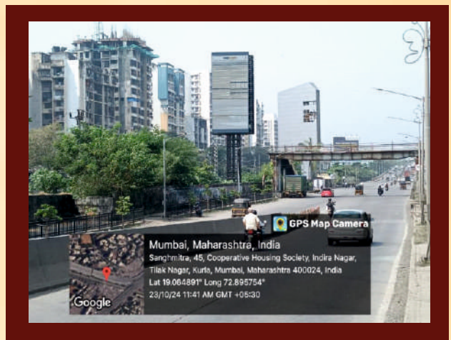
CHEMBUR 20X40 ON SCLR ROAD MT LED

Disclaimer - "The above Hoarding advt. have been serviced through our associates, where Genius Advertising executed creative artwork and hoarding Placement."