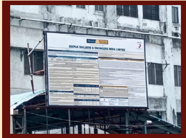
MARINE LINES 15X10 ON PRINCESS STREET FLYOVER, NR. STATION, ET, LED