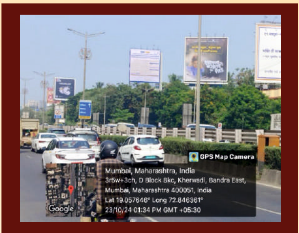
BANDRA 40X40 ON WEH, ON THACKREY FLYOVER ET LIT