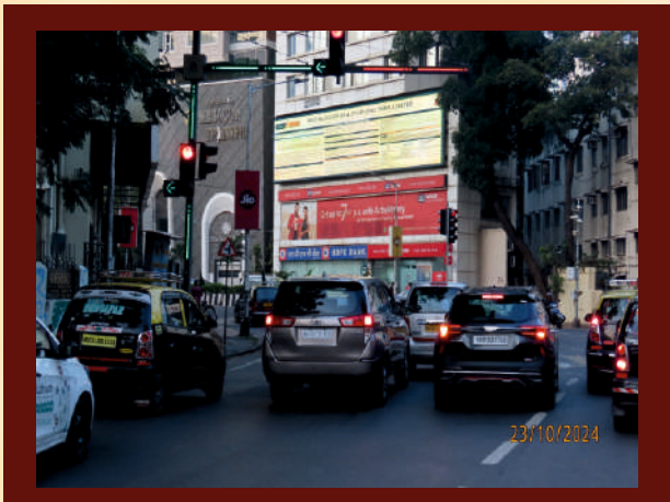
MARINE DRIVE 60X16 AT BABULNATH JUNCTION ET LED